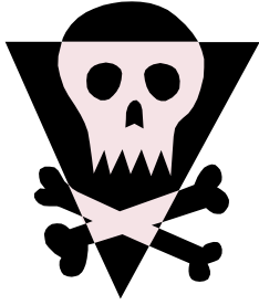
Toxins in the environment subject of Spring meeting